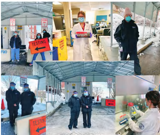
NEBH staff also quickly mobilized a drive-up testing site outdoors on the hospital's Mission Hill campus and the hospital's laboratory staff quickly delivered results for patients and staff.