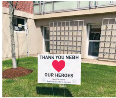
Throughout the spring surge of the COVID-19 pandemic in Boston, NEBH continued to support the Mission Hill community.