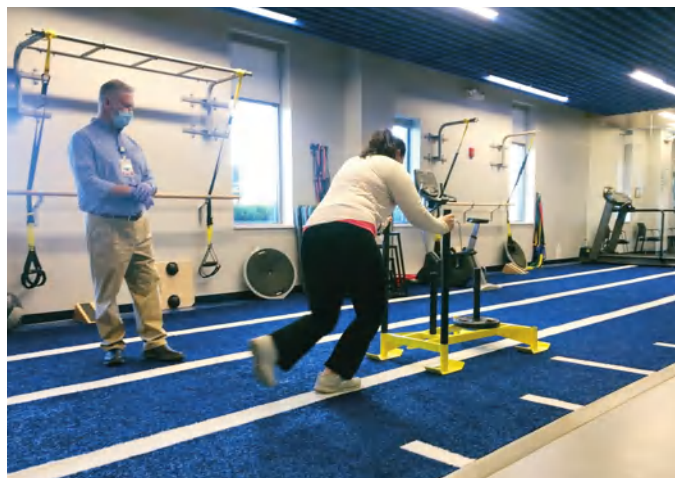
Patient rehabilitation at the NEBH Sports Performance Center