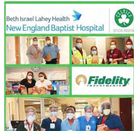
Fidelity Investments sent a catered meal from local small business, Penguin Pizza, to thank NEBH staff for their hard work throughout the pandemic.