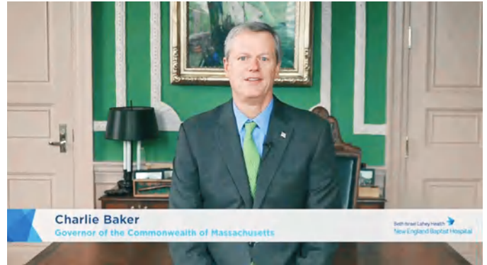
Massachusetts governor, Charlie Baker, shared a message of support and encouragement as part of the Virtual Gala celebration.