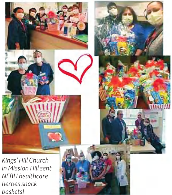
Kings' Hill Church in Mission Hill sent NEBH healthcare heroes snack baskets!