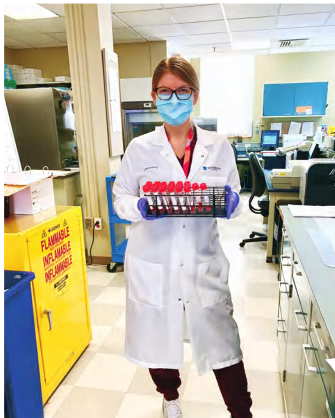
Testing of patient samples in the NEBH lab