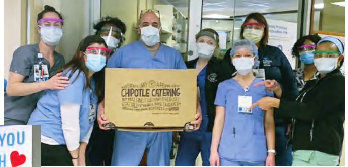
Boston Celtics players Romeo Langford and Grant Williams made a generous donation of Chipotle to our NEBH staff! This thoughtful donation was their way of recognizing and saying thank you to the staff caring for our patients throughout this crisis.

While NEBH worked to support the community, so many generous community members and partners in return supported NEBH! A heartfelt thank you to the many businesses and individuals who made in-kind donations to our staff.